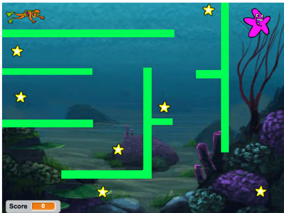
Figure 2. Screen Shot of the Scratch Maze Game Used In Questions 8-11

Participants received one point for each star collected and three for completing the maze. If they touched the maze walls, they were sent back to the beginning of the program. There were seven separate bugs in the Scratch script, which it was anticipated that the participants would have the ability to identify.